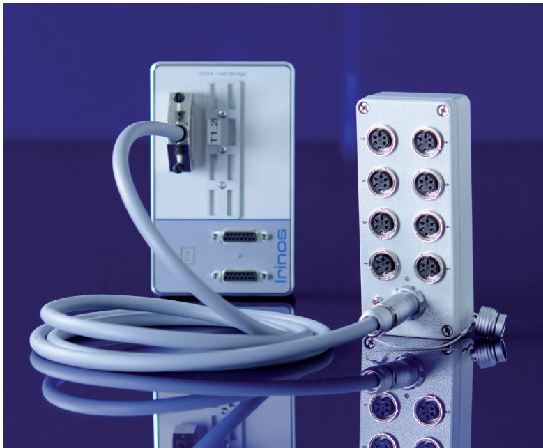
Quick-change system TAS10

It is further possible to un-plug or plug multiple measurement probes simultaneously from/to the measurement electronics without requiring a power-off. This allows for quick exchange of different measurement devices.